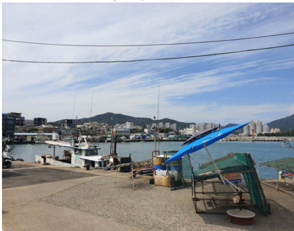
Icheon fishing village