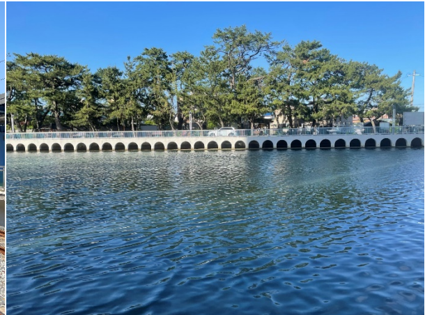
The Icheon Bridge area